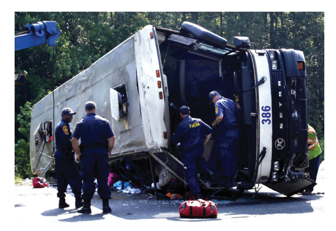
The Virginia State Police Accident Reconstruction Team and Motor Carrier Safety Team inspect a bus that was involved in a single-vehicle accident Tuesday, May 31, 2011, in Bowling Green, Va. The commercial tour bus went off Interstate 95 in Virginia and flipped on its roof before dawn Tuesday, killing four people and injuring many more, state police said.

Prior to 1982, the intercity bus industry was strictly regulated by the Interstate Commerce Commission (ICC), which became the Surface Transportation Board in 1995.